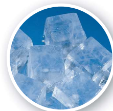
Ice: Standard Cube (L) Size: Approx. 28 x 28 x 32mm