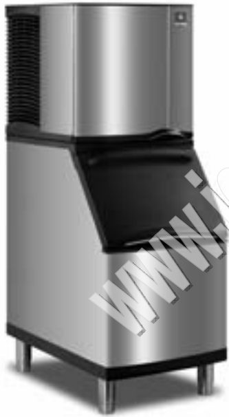
SD-0322A Ice Machine on B-320 Bin