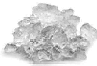
MXF 1027 Superflake ice Residual water content 12%